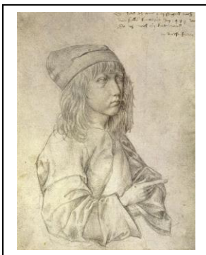
Albrecht Dürer 1484 and 1498

One of the earliest childhood self-portraits surviving is by Albrecht Dürer, who depicts himself in naturalistic style as a 13-year-old boy in 1484. He paints himself many times, often as different characters. Dürer would more than likely have been a fan of the 'selfie'.